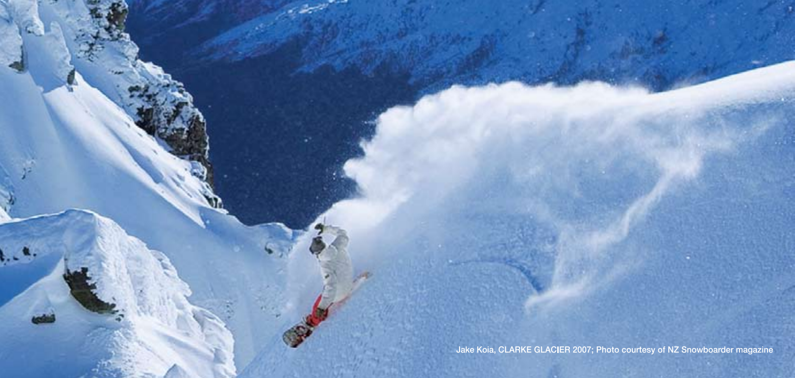
Jake Koia, CLARKE GLACIER 2007; Photo courtesy of NZ Snowboarder magazine